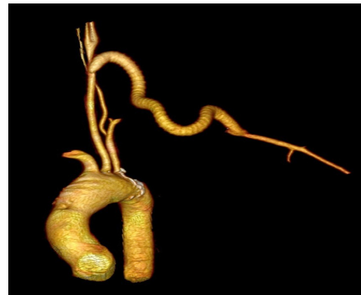
Figure 2: 3D-rendering of carotid-axillary bypass.