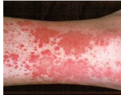
Figure 1: Wheals and erythematous maculae on skin.

(16 weeks). She continued taking injections for further eight months because of mild relapse with new wheals. Further, UVAS decreased to five (5) with improved quality of life in one year. We decided to continue omalizumab till remission was achieved over the next twelve months, the disease activity progressively decreased to remission (UVAS=0). She was followed up over the next five years with sustained remission and no apparent adverse effects after 28 injections of Omalizumab 150 mg monthly.