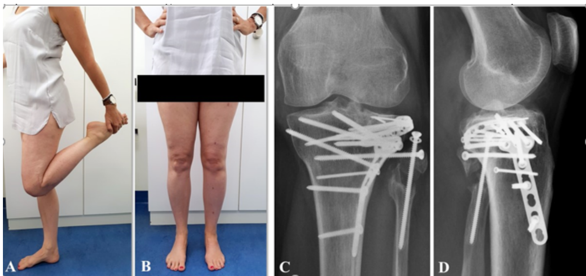
Figure 4: Case No.1: (A/B) Showing a satisfactory range of motion (E/F 0-0-140) 6 months postoperatively. (C/D) X-rays showing the healed tibial fracture with no significant step-off after 12 months postoperatively.