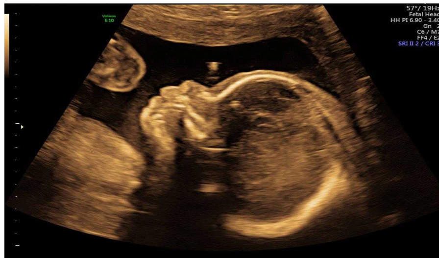
Figure 1: Midsagittal scan of the fetal profile (B mode).

Neurosonography was unremarkable as far as assessable at early gestational age. The stomach could not be visualized in the left upper abdomen. In the right upper abdomen, a cystic structure was visible and therefore a situs inversus abdominalis could not be excluded. Fetal echocardiography revealed abnormal atrioventricular (AV) valves, and an atrioventricular septal defect (AVSD) or an atrioventricular canal defect was suspected. There was also reversed flow in the ductus venosus (DV). The couple was informed in detail about the findings and genetic investigation by amniocentesis was recommended. After a reflection period, amniocentesis was performed without any complications at 17 3/7 weeks gestation. 5 out of 7 cell clones showed a free trisomy 22, revealing a trisomy 22 mosaicism.)