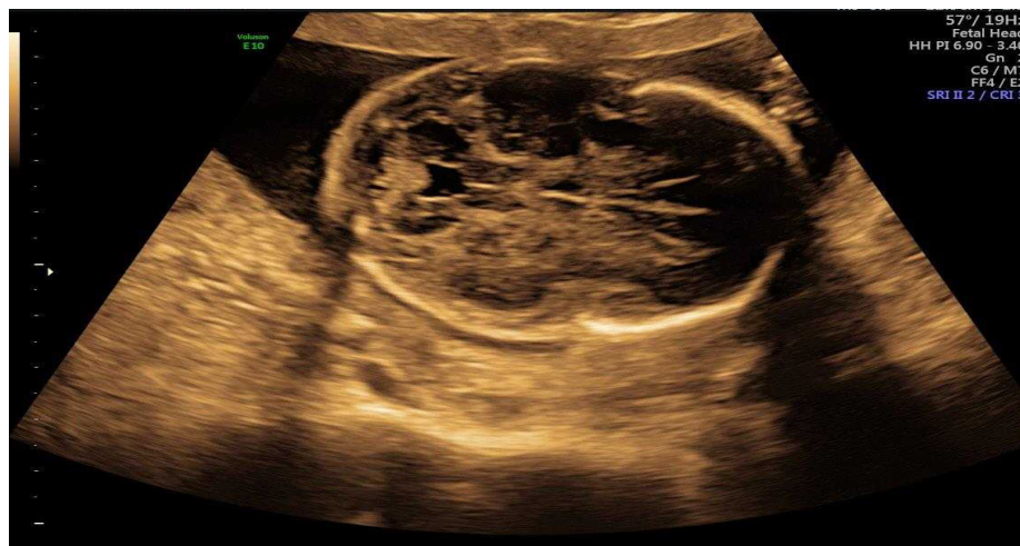
Figure 2: transverse scan of the cystic lesion in the cerebellum (B mode).

Another detailed ultrasound examination was performed at 20 weeks of gestation and showed a perimembranous VSD and a suspected ASD. The forehead was still prominent and there was no stomach in the left upper abdomen. In addition, we found a cystic structure in the cerebellar region (figure 2).