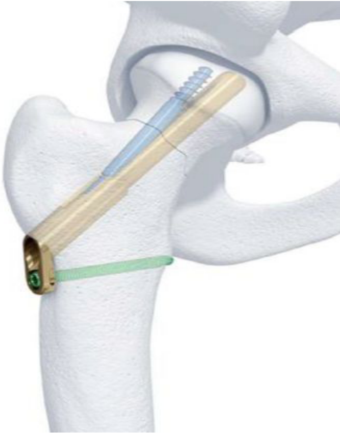
Figure 4: Schematic illustration of the FNS, consisting of a small side plate and a screw locked into a bolt providing angular stability and allowing free gliding within the baseplate and thus reducing lateral protrusion. © DePuy Synthes, Surgical Technique, Femoral Neck System (ENG/DE).