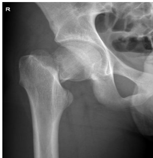
Figure 1: AP radiograph of the right hip showing a displaced transcervical femoral fracture with a vertical fracture line of about 70° (AO31B2.1 or Delbet II, respectively).

mobilization with partial weightbearing was allowed. The patient was discharged on day 3. Full weightbearing was achieved at 6 weeks. During routine follow-up at 6 weeks, 3 and 6 months, the fracture healed uneventfully, showing neither loss of reduction nor any early signs of avascular necrosis. Clinically, an excellent functional outcome could be achieved with free range of motion and no signs of leg length discrepancy. No soft tissue irritation was caused by the side-plate. The patient was happy and had even fully returned to his pre-injury sports level.