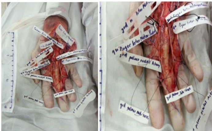
Figure 1: Dissection of the palmar crease and volar aspect of the third finger.