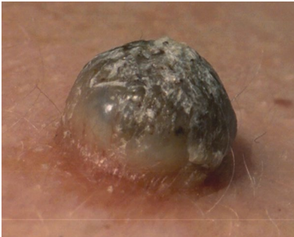
Figure 1: Comedo Clinical

A 61-year-old woman had adult type diabetes and hypercholesterolemia. For a few years she had mild to moderate plantar pustular eczema treated with intermittent topical class II corticosteroids. She developed within a month in the middle upper back a slightly itchy ball-shaped dark tumor with a diameter of 7 millimeters. The clinical picture (Figure 1) was fitting best to keratoacanthoma, and differential diagnosis included spinocellular carcinoma, atypical melanoma and pyogenic granuloma. The histology (Figure 2) revealed a comedo with a mild inflammation.