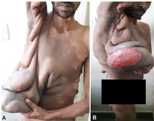
Figure 1: (A) A large mass in right axilla along with a large café au lait macule covering almost the entire chest and abdomen is visible. Multiple small nodules all over the body can be observed. (B) The axillary mass has grown to form multiple skin folds, resulting in massive excoriation of the underlying skin. Multiple café au lait macules can also be appreciated on the lateral aspect of right thigh.

We report a case of a 30 year old male who presented with a chronic history of progressively growing mass in his right axilla. Multiple smaller sized neurofibromas were appreciated all over the body including face, trunk and legs ranging from 0.7cm to 4.3cm in widest diameter, which also showed a positive buttonhole sign. Additionally, multiple café au lait macules (more than 6 in number, each greater than 15mm in size) were seen on various parts of the body (Figure 1), providing clinical diagnosis for Neurofibromatosis Type 1 according to National Institutes of Health Consensus Development Conference [5] . Histopathological evaluation confirmed the diagnosis of plexiform neurofibroma (Figure 2). The patient was advised surgical intervention for symptomatic relief. He was counselled regarding its benefits, probable complications and chances of recurrence in this case. The patient however, denied surgery for the time being, post which he was lost to follow up.