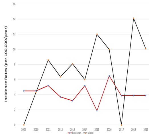
Figure 1: Incidence Rates from 2009-2019 for both Maori and European males.

We identified 122 patients, aged 17 to 73, who underwent radical orchidectomy from January 2009 to July 2019. After application of the exclusion criteria (paratesticular tumour, n =1 and insufficient histology to allow tumour classification, n =2, Asian ethnicity, n =2, non-identified ethnicity, n =4), 113 patients files were used for analysis. The majority of our cohort had no other medical comorbidities. Based on population data from the 2013 NZ census [4], the observed incidence rate of testicular cancer in the Waikato Region in European males was 5.6/100,000 person-years, compared to 12.3/100,000 person-years in Maori males (Figure 1).