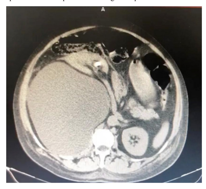
Figure 1: Abdominal and pelvic Computer Tomography (CT) scan showing large cystic mass in the right hemiabdomen.

The patient was subjected to laboratory and radiology exams, which presented the following results: Abdominal-pelvic tomography detected right kidney displacement by a large cystic mass (20x20 cm) that extended from the pelvis to the right upper quadrant, with right staghorn calculus (Figure 1). In addition, there were calcifications in the right distal ureter. Chest tomography detected a pulmonary nodule of unknown progression in the right lower lobe (it measured 13.6 mm), as well as pulmonary consolidation in the right lower lobe. Doppler ultrasonography of the left lower limb detected acute deep vein thrombosis in the femoral-popliteal and popliteal artery segments, and acute superficial thrombophlebitis in the great saphenous vein arch.