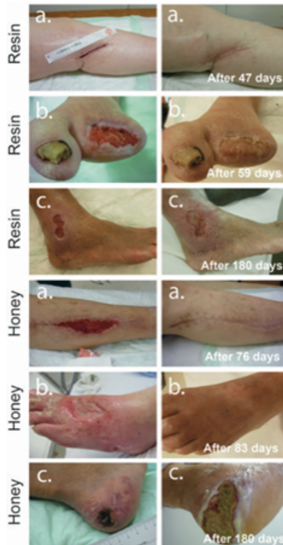
Figure 2: Photographs of acute and chronic wounds at the beginning (left) and end (right) of follow-up. Wounds were treated with either (top 3 rows) resin salve or (bottom 3 rows) medical honey. (a) Acute infected surgical wounds (SSIs) with successful outcome; (b) chronic ischaemic ulcers with successful outcome (ulcer healed); (c) chronic ischaemic ulcers with unsuccessful outcome (ulcer not healed within the 6-month treatment period). Treatment times are indicated in each case.