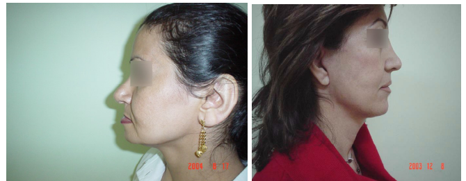
Figure 4: two different indicated cases for this technique.

Young patients (25 - 45 years old) with good skin elasticity with full and dropped malar fat pads (Figure 3). Bell's Palsy patient shows good results (more studies for long term results are needed) Patients with sagging jowls.