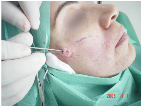
Figure 1: Creating a skin bridge by the two zygomatic incisions.