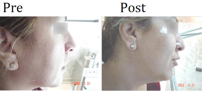
Figure 5A: Some pre and post-op cases.