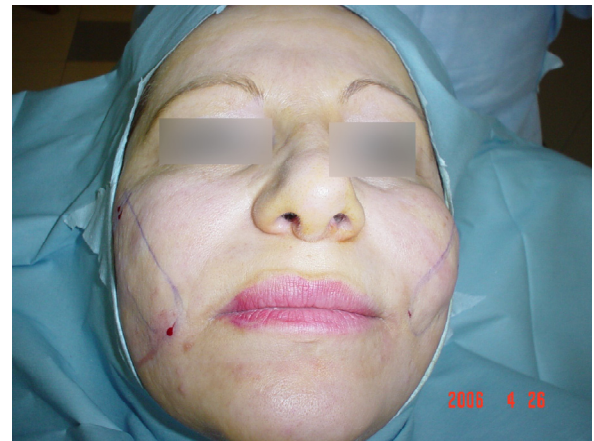
Figure 3: Right side; before. Left side; after.