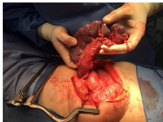
Figure 4: The enlarged prolapsed spleen with its torsed splenic pedicle, lifted from the right lower quadrant and detorsed. Areas of infarct are grossly apparent in the splenic parenchyma. Insufficient improvement following detorsion indicated the need for splenectomy.