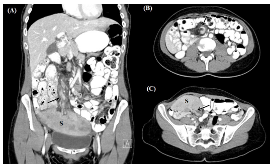
Figure 2: Computed tomography scan of the patient's abdomen and pelvis. (A): Coronal view. The wandering or prolapsed spleen (S) is seen in the abdominopelvic junction, compressing the urinary bladder. Torsion of the vascular pedicle is also seen (arrow). (B): Axial view, showing the whirl sign, representing torsion of the splenic vessels. (C): Axial view of the torsed splenic pedicle (arrow) entering the splenic hilum. Hypodense areas, likely infarcts, are visible in the splenic parenchyma.

A contrast-enhanced Computer Tomography (CT) scan of the abdomen and pelvis revealed an enlarged spleen, measuring 15 cm, located at the abdominopelvic junction rather than the left upper quadrant (Figure 2). Torsion of the splenic vessels were suspected due to positive whirl sign, along with the presence of several splenic hypodense lesions that appeared to be infarcts. The tail of the pancreas was pulled in the right anterior direction. The duodenum, normally crossing the midline from right to left, was found on the right side of the abdomen along with the jejunum, while the ileum, cecum and colon were found on the left. A normal appearing appendix was seen on the left side of the abdomen. The aforementioned CT scan finding were highly suggestive for the diagnosis of a wandering spleen and intestinal malrotation.