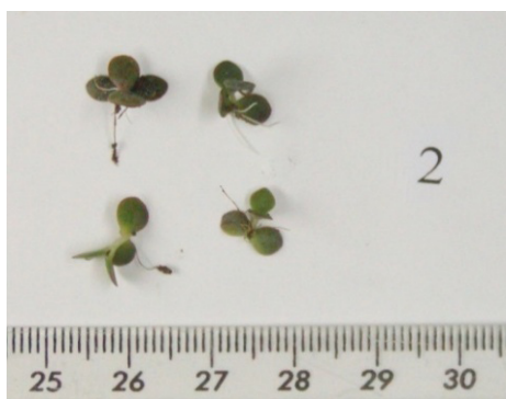
Figure 2: They aren't on the test (Figure 2), although they, too, have grown, but considerably behind in growth even in such a short period of time.

A simple experiment illustrating the role of water movement on the example of the development of Kalanchoe, observable in the laboratory.