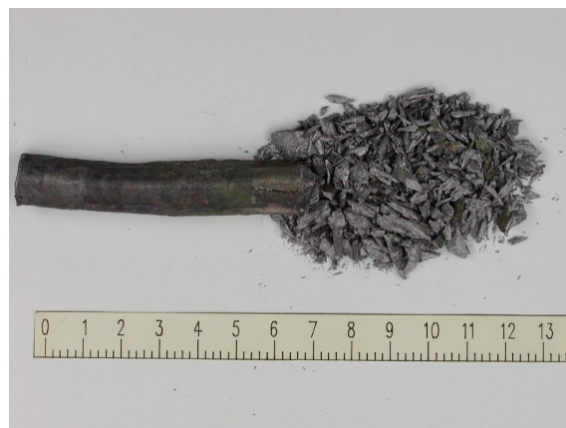
Figure 3: Monocrystal \alpha Sn growth under water in jacket of ice (left) after removal of ice number of embryos multiplies, giving polycrystal (right side of the figure).

There is the nature of the long-known mysterious of tin became clear, and infection under water allowed to give methods of obtaining single crystals of the interesting narrow-band semiconductor \alpha Sn, previously known only as a powder, and its effective purification, and production of Sn powder of the set dispersion and