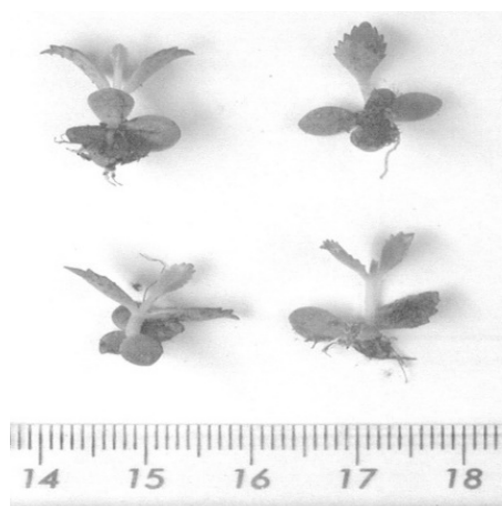
Figure 1: It shows the resulting new leaves.

matrix, in this case the plant itself. Moving water not only give the desired products of chemical reactions, but too in the polymer structure, depressed by restructuring and is able to build the desired matrix in the body, to patch its holes. Resting water of these qualities has not, it is less mobile in this respect.