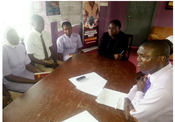
Figure 4: Showing faculty members interacting with the students.

The Students having an interaction with member of the faculty (Figure 4).