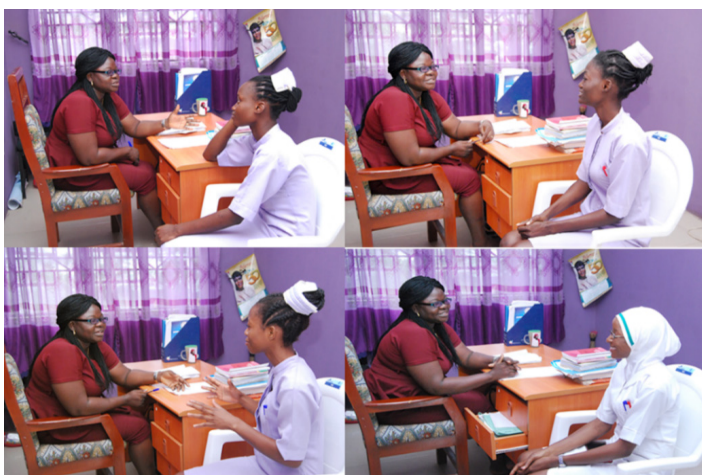
Figure 3: Showing the counselling unit sessions with students.

The Counsellor having sessions with the College Students (Figure 3).