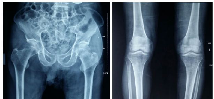
Figure 2: X-ray films of patients with knee osteoarthritis suffering from hip fractures. A was the patient's hip joint plain film, showed the right hip fracture; B was the patient's knee joint plain film, showed KL grade II.

Fracture side and the contralateral side knee were evaluated by KL classification, respectively: KL grade of fracture side was