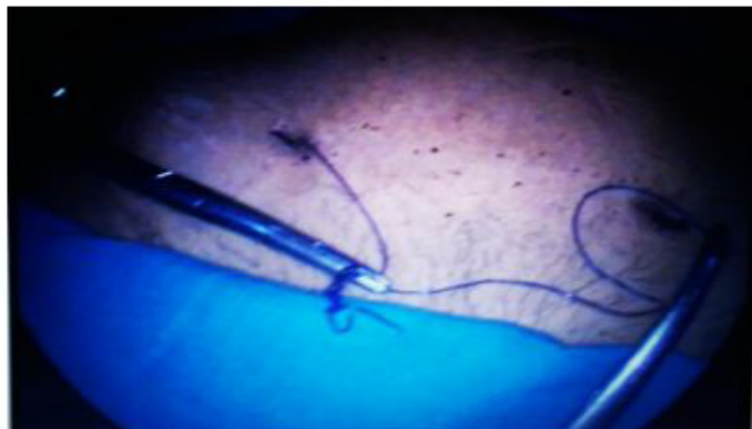
Figure 3: Mould creation.

The whole procedure has been performed under laparoscopic/cystoscopy vision which leads to negligible chances of injury to the bladder or intraperitoneal. There was no need of skin grafting. The problem of vaginal dryness or obliteration of neovagina does not happen as sufficient epithelization occurs in three to four months' time.