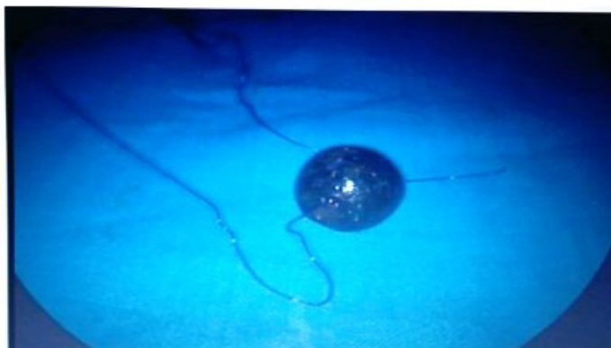
Figure 2: Glass Olive and Thread.

A suture grasping needle was used to pull out the traction sutures and tied to the locally developed traction devise with a locking bolt to apply gradual traction on the glass olive placed at the hymen dimple (Figure 2).