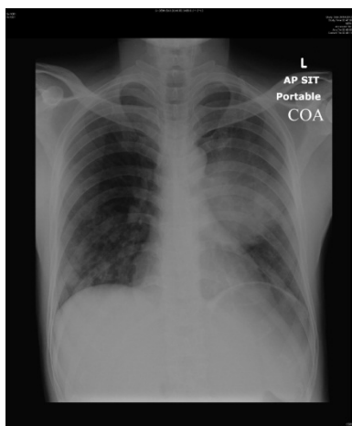
Figure 1: Chest X-ray showed a significant left upper lobe consolidation.

The second patient is a 24-year-old Indian shipyard worker who has been in Singapore for less than eight months. He presented to the ED with a referral from the GP for a history of 6 days of fever, coughing with purulent sputum and right sided pleuritic pain. A chest X-ray taken at the GP also showed a right upper lobe consolidation. Figure 2. He was tachycardic with a heart rate above 130 per minute and persistent low systolic pressure below 80 mmHg despite given a total of 5 litres of crystalloid. He was also hypoxic with a saturation of less than 90% despite on 100% non-rebreathing mask. He was intubated before he was sent the