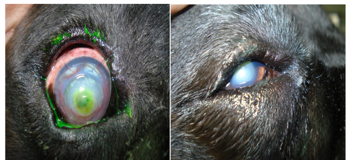
Fig. 1 – A: Adult male Boxer dog with a chronic ulcerative keratitis in the right eye. A bullous keratitis with central fluorescein positive ulcer was observed. B: At 15th days follow up disappearance of keratoconus and reduction of corneal vascularization were observed; a moderate corneal edema was still present.

An adult intact male Boxer dog (3 years) showed a chronic ulcerative keratitis in the right eye caused by a previous trauma. At the visit keratoconus, bullous keratitis with corneal neovascularization and edema were observed; a round ulcer was localized in the central cornea, positive to the fluorescein stain. The dog had been subjected to antibiotic and anti-inflammatory treatment for at least 7 days, without improvement. The dog was treated with autologous PRP eye drops twice daily for 15 days.