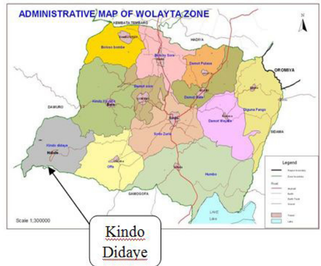
Figure 1: Map of study area