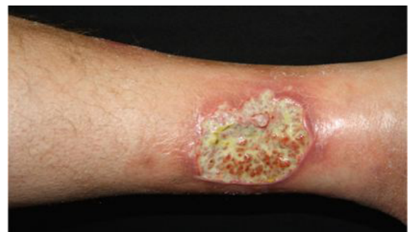
Figure 1a: Left medial distal leg

Physical examination revealed multiple 1-6cm ulcers with granulation tissue and rolled borders on the legs, the largest on the left medial distal leg (Figure 1a).