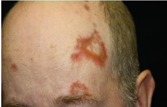
Figure 1b: Left frontal scalp.

Biopsies of the leg and forehead showed similar findings: features of granulomatous dermatitis with well-formed granulomas not associated with well-developed necrobiosis, a pattern consistent with sarcoidosis (Figure 1c). PAS and Fite stains were negative for fungal forms and mycobacteria, respectively. Tissue cultures for atypical mycobacteria, bacteria, and fungi were negative. Additional evaluation included a normal CBC, CMP, ACE level, chest x-ray, and pulmonary function studies. The patient was started on hydroxychloroquine for cutaneous sarcoidosis. However, he has since been lost to follow up.