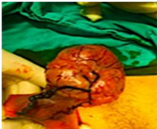
Figure 1: Intra-operative visualization of GIST tumor from the ileum with high vascularity visible.

It is recommended that a thorough evaluation is needed with right diagnostic tests and more importantly the appropriate intervention. Keeping in mind the prognostication, one must keep imatinib and other similar chemotherapies in point of discussion while explaining the disease to the patient (Figure 1-4).