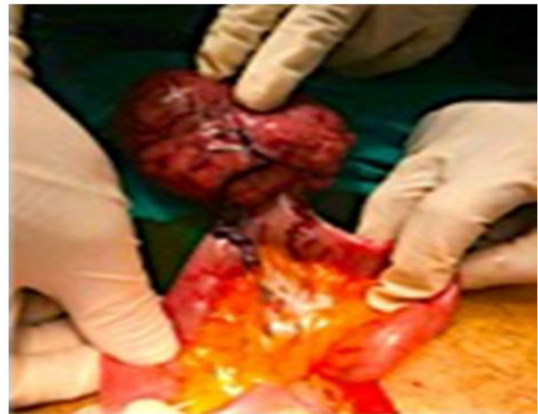
Figure 2: Intra-operative handling of the tumor within the ileal loops.