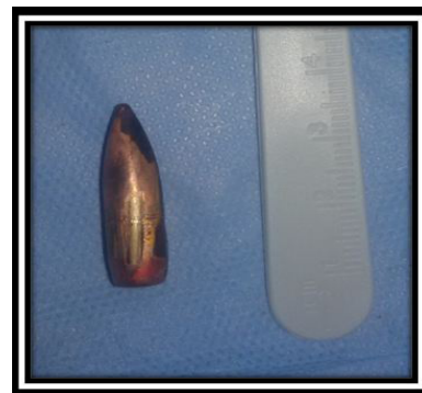
Figure 5: Bullet size.

antrostomy then done and the wound closed, Patient postoperative condition was very good.