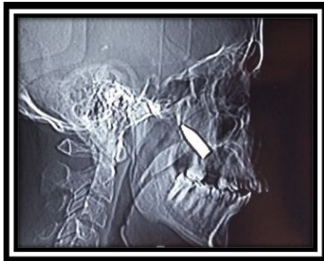
Figure 1: Plain radiograph showing the bullet lodged in the maxilla.

was conscious, alert, co-operative and well oriented. Examination revealed a 1-cm-wide entry wound on the right side of the face approximately 2cm inferior to the right eye. There was no evidence of an exit wound. The patients' vital signs were all within normal limits. There were no signs of active bleeding or pus discharge from the entry wound. Intraorally, there was no swelling, signs of laceration or ecchymosis. A plain radiograph (Figure 1),