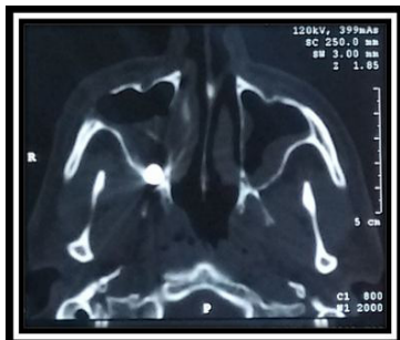
Figure 2: Computerized tomography (axial view) showing bullet position.

revealed a bullet lodged in the posterior wall of the right side maxillary bone, computerized tomographic scan showed that part of the bullet is settled in the right side maxillary sinus and pterygoid plates of the sphenoid bone fracture (Figure 2).