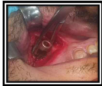
Figure 4: Bullet removal.

The patient transferred to the operation theater, and under general anesthesia a local anesthetic containing a vasoconstrictor is given 10 minutes before the surgery, then right side buccal sulcus mucosal incision is done extending from the buttress area to the midline, muscle dissection and reflection then a subperiosteal dissection extending from the zygomatic buttress to the pyriform aperture and extending superiorly till the inferior orbital foramen taking into our consideration the buccal fat pat position during the dissection to avoid its herniation and the inferior orbital nerve localization to avoid any neural injury with dissection or retraction, after the exposing the whole anterior wall of the maxilla, a bony window in the wall of the maxillary sinus was made and the site explored, a bleeding haemostasis achieved successfully and then irrigation with bullet localization blindly through a Kelly clamp, then the bullet removed from the maxilla through the same exploration site (Figure 4,5),