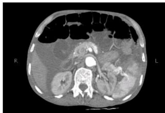
Figure 4: Contrast Enhanced CT Scan Cross-sectional View Showing Splenic Laceration with high density ascites indicative of haemorrhage with no evidence of active bleed.