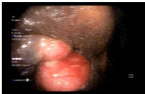
Figure 2: Image taken with colonoscope showing prolapsed haemorrhoids with visible mucosa from the anal verge.

Patient was discharged after ten days of admission. After his CT scan revealed splenic laceration induced post colonoscopy which was responsible for bleeding within the abdominal cavity he was managed conservatively with frequent Hb monitoring and blood transfusions. The patient gradually recovered and at discharge was tolerating regular diet and was fully mobile. At his first follow up in clinic after a week the patient was remarkably improved, and he was advised to resume activities of daily living.