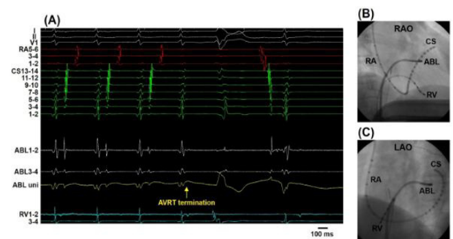
Figure 3: (A) Intracardiac electrogram shows that the atrioventricular reciprocating tachycardia (AVRT) was terminated soon after applying radiofrequency energy and the sinus rhythm was recovered. (B) Right

Application of only 4.5 s of 20 W radiofrequency energy to this point terminated the AVRT followed by the VA block (Figure 3). We then applied additional 30 W energy at contiguous points under ventricular pacing. VA conduction via the treated AP never recurred even after bolus administration of adenosine triphosphate or continuous infusion of isoproterenol. Furthermore, dual atrioventricular nodal pathways were ruled out and no other types of tachycardia were induced by programmed stimulation thereafter. During the following 6 months, she was free from palpitation without the use of antiarrhythmic drugs. We thus concluded that the AVRT was cured.