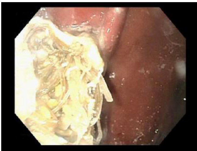
Figure 3: Gastric Bezoar above Gastrojejunostomy as visualized during endoscopy.

The patient was admitted to the hospital and underwent an upper endoscopy. The lower third of the esophagus was found to be moderately tortuous, with a dilated gastric pouch containing a bezoar with large amount of food debris (Figure 3). The pouch-to-jejunum limb measured approximately 7cm from the anastomosis to Z-line. Food debris was cleared using biopsy forceps, roth nets, and an Edlich gastric lavage kit; using greater than 3500cc of sterile water. The patient tolerated the procedure well. She was started on a full liquid diet and discharged the following day.