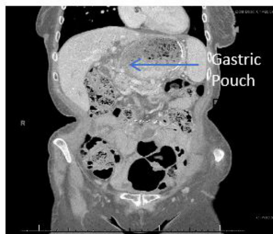
Figure 1: Abdominal CT with IV contrast showing gastric-pouch dilation (coronal plane).

suspicious for obstruction due to retained food debris/bezoar with associated inflammatory changes. An anastomotic ulcer could not be evaluated due to retained debris. There were no definitive findings to suggest perforation.