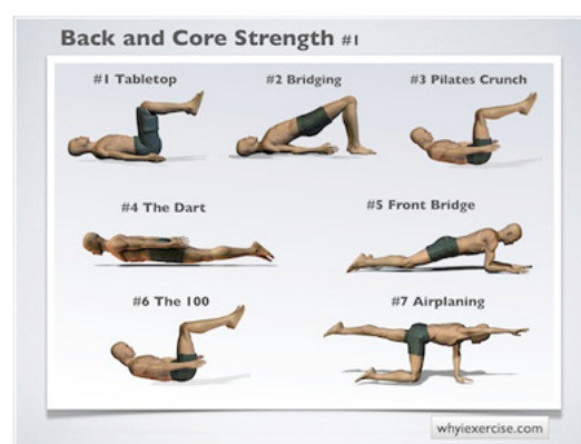
Figure 3: Exemplary isometric exercises.

Exemplary isometric exercises are illustrated in Figure 3. Recommendations often include starting with exercises number 1, 5 and 7 illustrated below, beginning with one minute for each exercise, twice a day, and then increasing as tolerated to at least 20 minutes a day total of those and other exercises.