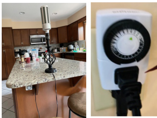
Figure 1: Portable ultraviolet light (UVC/UVA) lamp mounted on stand and set via appliance timer for surface disinfection. Timer below kitchen counter is illustrative of the type shown here.

We anticipate and advocate any combinations of the above formulations and methods with ultraviolet light (UVC/UVA) surface disinfection using standard LED, fluorescent lamps or other light emitting devices, and even a simple timer (see below) set for times people are not in the room being treated (e.g. 3-4 am). We anticipate and advocate use of our device system of light source and timer. As illustrated in Figures 1, 1a, 2, 2a, 2b and 2c, the lamps of this additional system and method can be installed in ceiling fixtures or on mounts and used to disinfect surfaces, purchases and groceries. Extrapolating from sterilization times under lab conditions of the studies [25-27], we suggest using our system of lamps with timers (or of lamps without timers in vacant and preferably closed rooms or other enclosures such as closets) for a one hour time period. With adequate precautions and eye-protection, the same lamps can be used hand-held to disinfect surfaces, purchases and groceries.