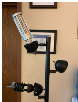
Figures 1a and 1b: UVC/UVA (black light) stand for office waiting room after-hours disinfection.