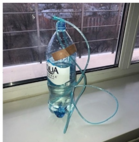
Figure 4: A person wishing to incorporate PULMONARY CAPACITY with a device such as that depicted, would inhale through the nose and exhale by mouth into the free end of the tube, forcing bubbles through the water. The duration of the exercise can be set based on the patient’s tolerance/capacity and may be increased accordingly. Our recommendation for duration is at least 15 minutes daily.

We recommend repeating the personal regimen cycle of breathing exercises 2-3 times a day. (In a hospital setting, typically only the PULMONARY CAPACITY stage’s blow-bottle activities are conducted. We recommend a full personal regimen including all stages.)