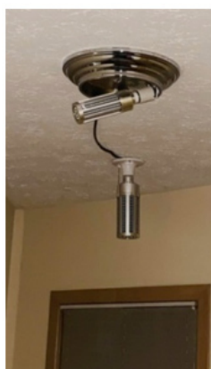
Figure 2: Use of existing fixture of mudroom (or any other closed room) for ultraviolet light disinfection.