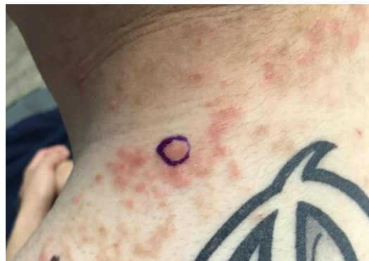
Figure 1: Erythematous individual papules, coalescing papules forming small plaques and rare papulovesicles, some excoriated, in association with mottled and reticulated pigmentation on the neck and upper back.