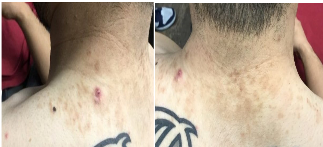
Figures 3A,B: Resolving lesions, associated with resultant reticulated and mottled pigmentation.