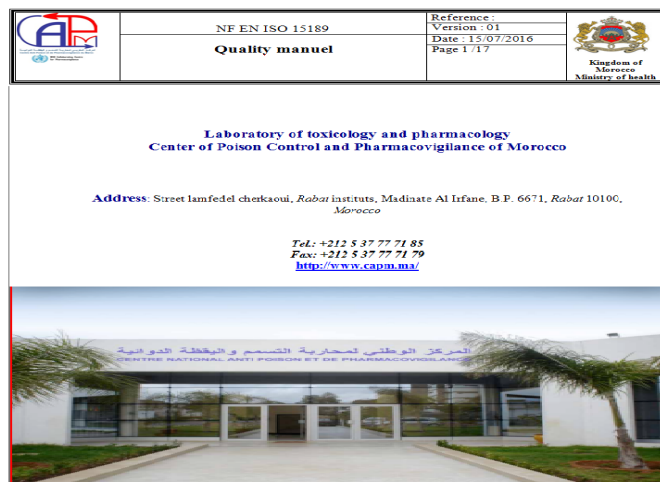
Figure 2: Quality manual cover.

We developed a quality manual which presents the general provisions adopted and executed by the laboratory in order to guarantee the quality of its provided services in compliance with the current regulations and the NF EN ISO 15189 version August 2007 standard.