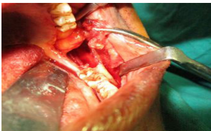
Figure 4: Enucleation followed by application of Carnoy's MC.

Head of the condyle was normal and unaffected. Computed Tomographic (CT) scans were not advised due to poor socio-economic condition of the patient. The remainder of physical examination was non-contributory. A provisional diagnosis of residual cyst, traumatic bone cyst, primordial cyst, kcot, and ameloblastoma was made on the basis of clinical and radiographic appearance. Under all aseptic conditions and precautions, under general anesthesia, intra oral extended ward incision was placed from left mandibular 2 nd premolar region till coronoid process running over lateral part of mandible. Full thickness mucoperiosteal flap was raised, cyst exposed and careful enucleation was done (Figure-4).