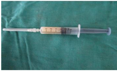
Figure 2: Aspiration fluid.

It was sent for Histopathological examination. A panoramic radiograph revealed a well-circumscribed unilocular radiolucent area extending from distal of mandibular left 2nd molar till the ipsilateral sigmoid notch. No evidence of destruction of posterior border of ramus was evident (Figure-3).