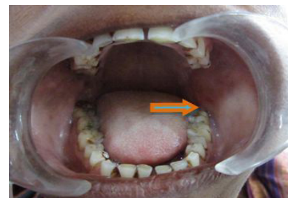
Figure 1: Pre-Op Intra oral view.

A female patient, aged 37 years presented to the Department of Oral and Maxillofacial surgery with chief complaint of intra oral painless swelling for past 6 months which was constant size and shape on clinical inspection, it extended into and obliterated the left posterior mandibular muco buccal fold starting from distal of lower left first molar till the ipsilateral anterior faucial pillar covering the whole left retromolar trigone. (Figure-1).