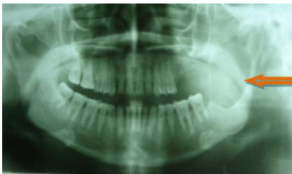
Figure 3: Panoramic radiograph showing the cystic lesion.

It was sent for Histopathological examination. A panoramic radiograph revealed a well-circumscribed unilocular radiolucent area extending from distal of mandibular left 2nd molar till the ipsilateral sigmoid notch. No evidence of destruction of posterior border of ramus was evident (Figure-3).