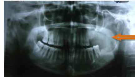
Figure 5: Post op OPG after 24 months.

the patient was having an appreciable mouth opening with normal functions. The follow up of this particular patient was done for 2 continuous years, every alternate month and no signs of recurrence were seen (Figure-5).