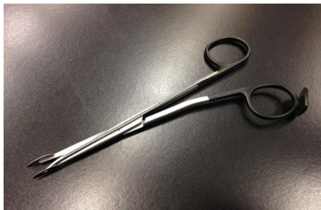
Figure 1a: The minimal undermining suspension technique MUST dissector.

Here we present a minimally invasive surgical technique for facial rejuvenation, the MUST technique, performed using an innovative tool, the MUST dissector (Figure 1) which allows a safe dissection of anatomical tissue planes to perform safely a mid-face and eyebrow lift.