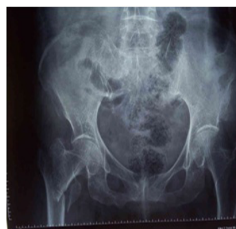
Figure 3A: An 86-year-old female with intertrochanteric fracture (Evans VI) preoperative X-ray).