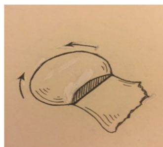
Figure 1C: Retraction of two parts for removal of femoral head.

The first step of osteotomy should be taken vertically to the neck at the sub-capital level when the hip was slightly rotated internally after retracting the capsule above and below the femoral neck with two Hoffman hooks (Figure 1 B). Four main fragments including the greater and lesser trochanters. Femoral shaft and the retained portion of the neck will be left after removal of the femoral head (Figures 1C and 1D).