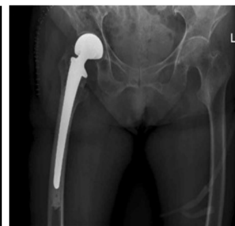
Figure 2B: An 81-year-old female with intertrochanteric fracture (Evans VI) postoperative X-ray).