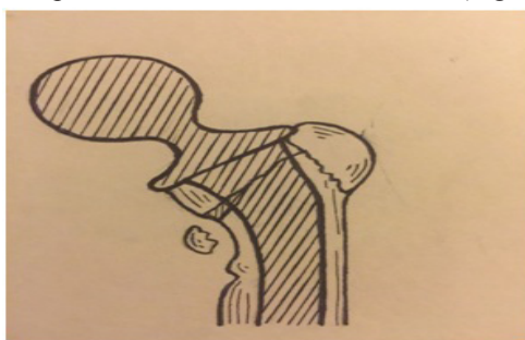
Figure 1 G: Insertion of prosthesis.

The second-generation cementing technique and cement restrictor were used in all cases. Check the ante version, leg length by above mentioned methods again during the final fixation of the stem. Traction and reduction were made, the capsule, tendon of the piriformis, conjoint tendon of the obturator internus as well as gemelli were repaired and the incision was closed (Figure 1G).