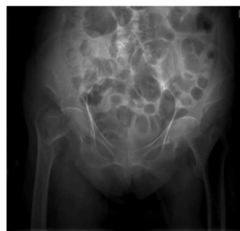
Figure 2A: An 81-year-old female with intertrochanteric fracture (Evans VI) preoperative X-ray).

The average pre-injured FRS, predictive value of operative morbidity and mortality were 82.7(81.6—84.9), 9.2%(7.1%--14.9%) and 3.4%(2.1%--4.3%), respectively. The average operation time was 45 minutes with a mean intra operative blood loss of 300 ml. There were no operative or anesthetic complications or deaths within 30 days after operation. Sitting up was permitted 3 to 4 days, and partial weight bearing was allowed 5 to 7 days after operation. The average FRS was 78.3 at 30 days and 83.9 at 1 year postoperatively. Eleven patients died of unrelated causes (Five due to myocardial infarction and the others due to cerebral hemorrhage) during at least one-year follow-up (Figures 2A, 2B; 3A, 3B ) (Table 1).