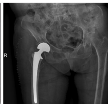
Figure 3B: An 86-year-old female with intertrochanteric fracture (Evans VI) postoperative X-ray).