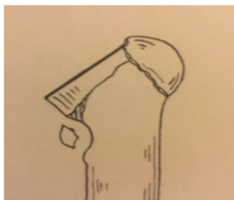
Figure 1F: Second step of Osteotomy.