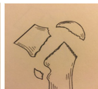
Figure 1D: Postosteotomy picture.