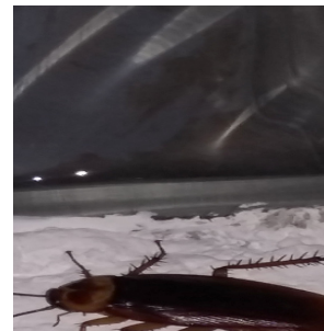
Figure 1. intradomiciliary Cockroach ( Periplaneta americana ).

The bronchopulmonary lophomoniasis is a condition caused by eating or accidentally suck cysts or trophozoites of protozoan intestinal anaerobic multiflagelado, Lophomonas blattarum (Parabasalid: Hypermastigia, Cristomonadida, Lophomonadidae). This parasite has been characterized as an endocommensal in the gut of some arthropods, like termites and cockroaches (Dyctioptera: Blattoidea), which pollute its path, food, dust and clothes with their secretions and feces [1]. Cockroaches (Figure 1).