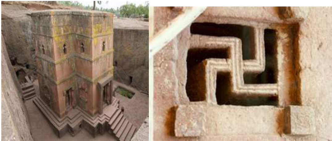
Figure 6: Different views and Motifs of Lalibela churches.