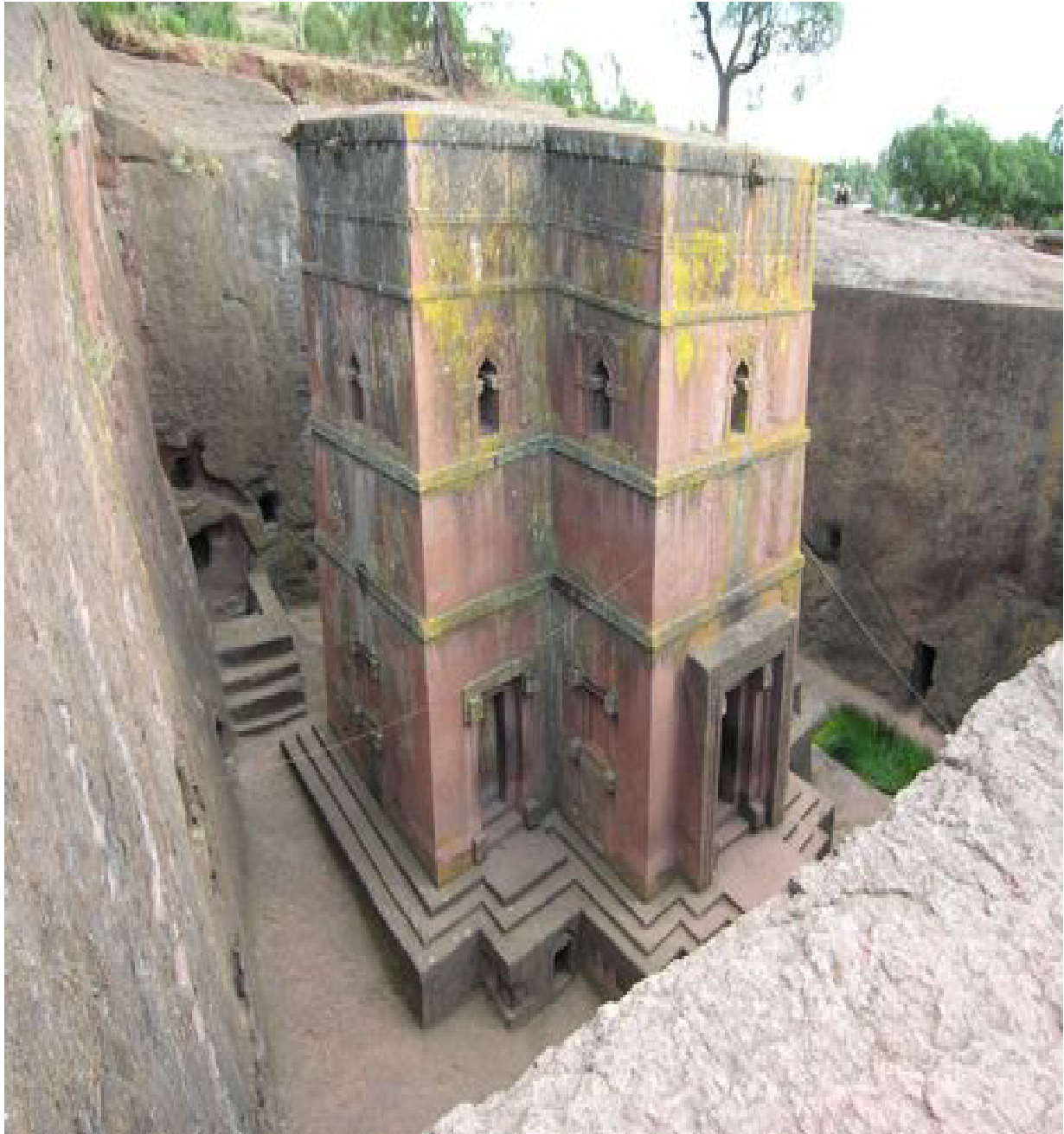
Figure 5: Bete Ghiorgis Rock hewn church of Lalibela, Northern Ethiopia, Wollo Region (12-13 th centuries AD) (Courtesy of son Dawit Tadesse).

matter and the loss of color of paintings are evident to the visitor. Likewise, oxidization and rainwater runoff on the walls create clear and subtle damages to the structures (Figures 5-10).