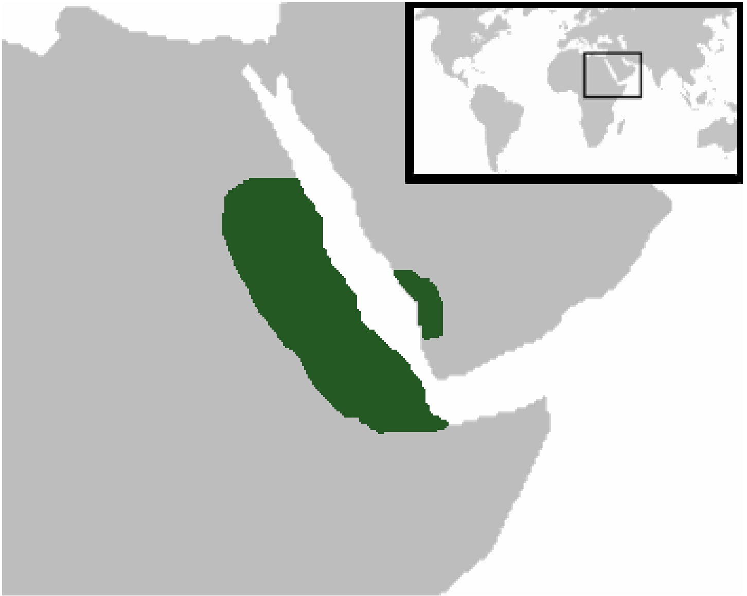
Figure 1: The approximate boundary of the Axumite civilization at its heyday-4-6 th century AD.