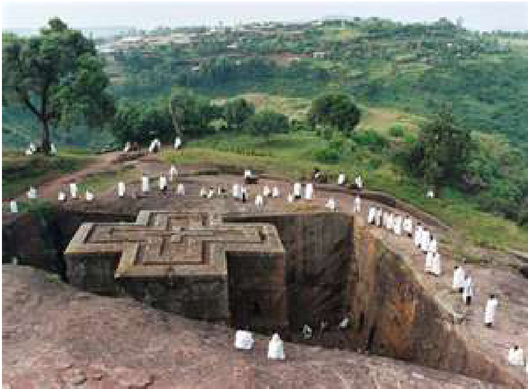
Figure 9: Lalibela rock-hewn churches- church attendees against background site features.