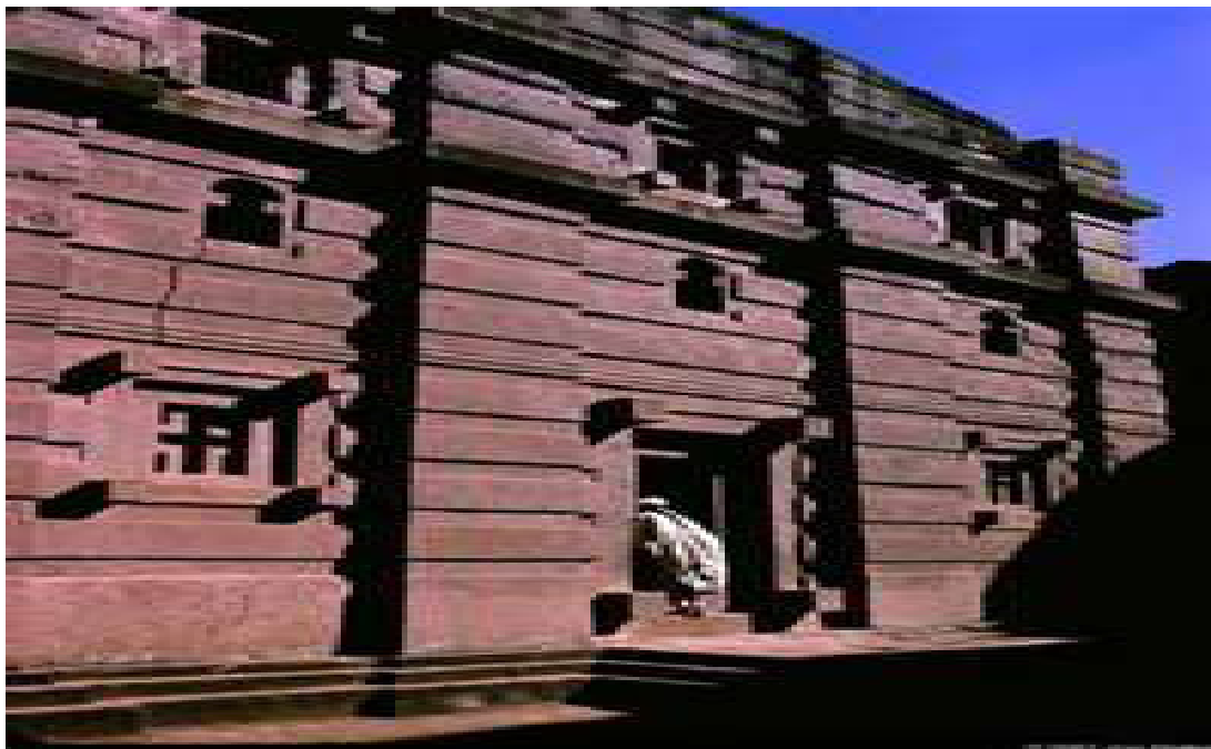
Figure 10: Lalibela rock-hewn churches-architectural details of façade, window and door motifs [5].