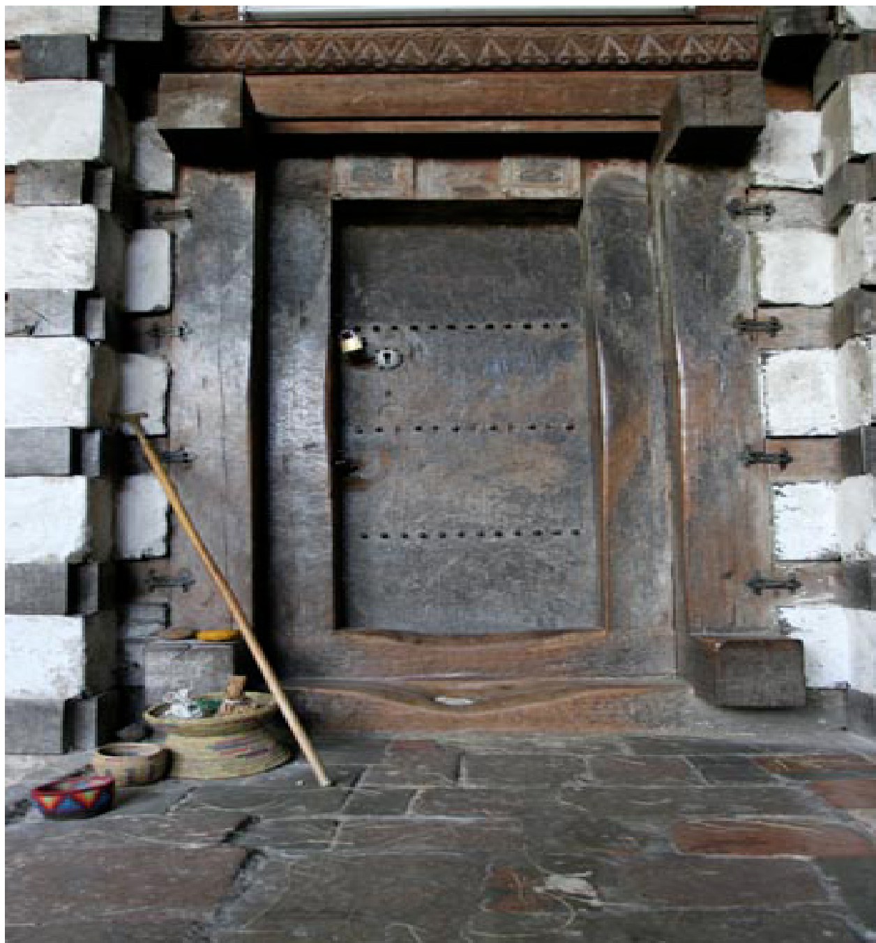
Figure 8: Lalibela rock-hewn church entrance.