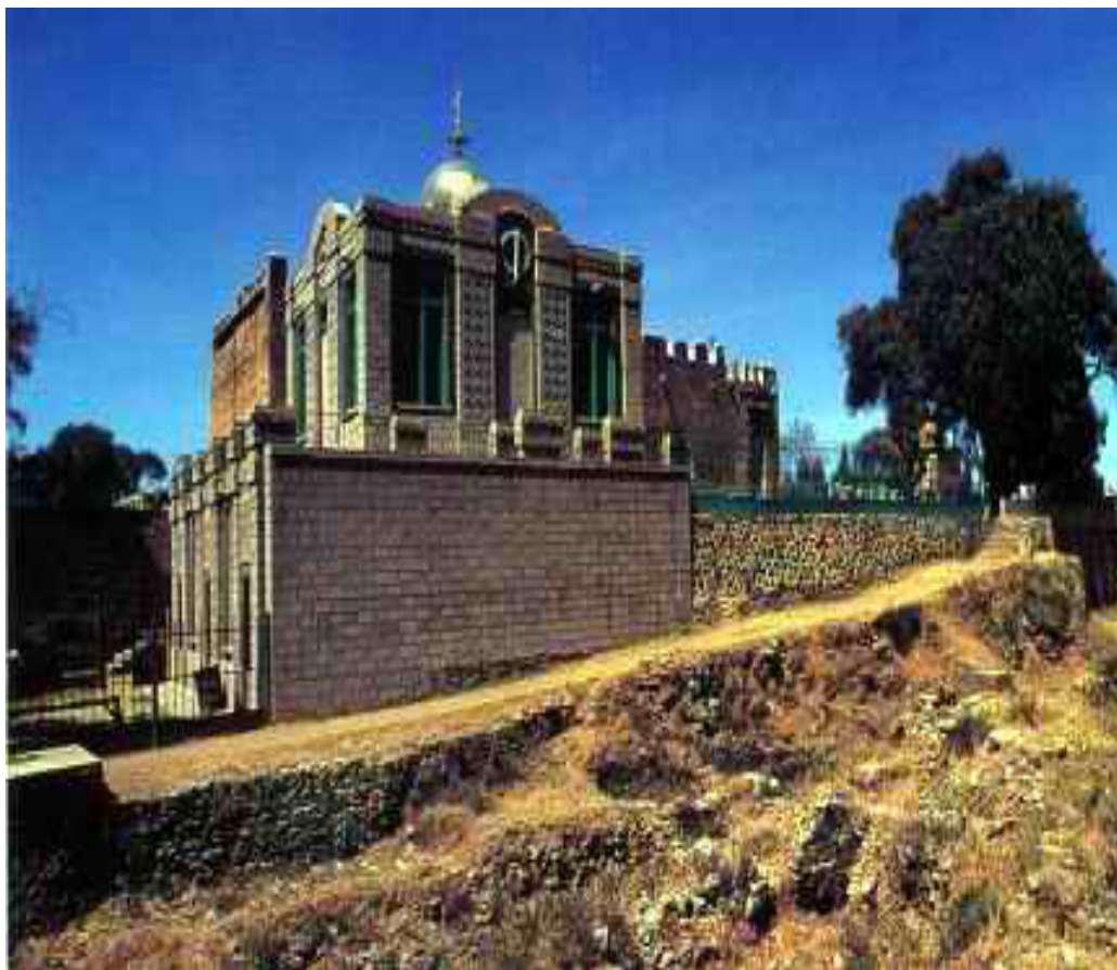
Figure 3: Axum Tsion - St. Mary's Church.