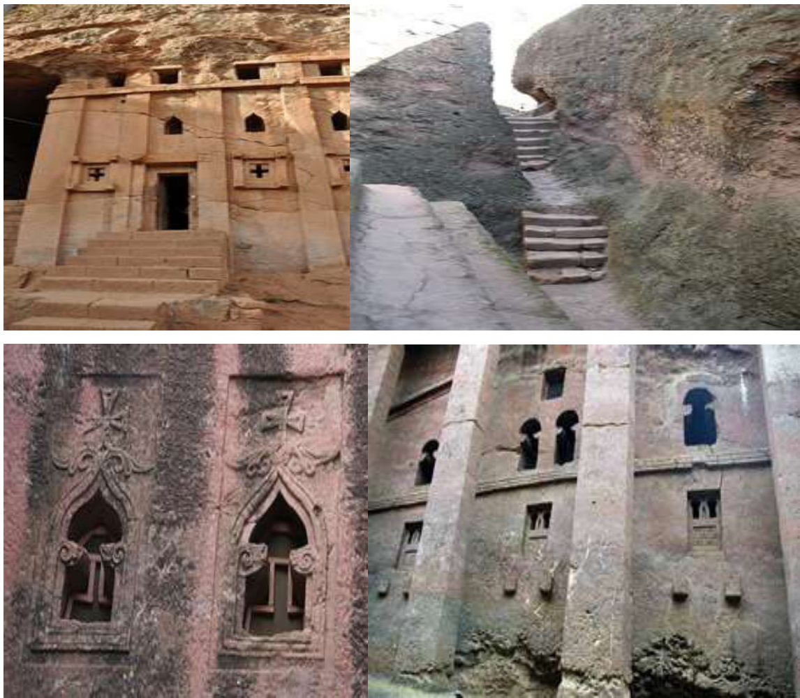
Figure 7: Rock hewn churches of lalibela- window, door motifs and pathways (12-13 th centuries AD).