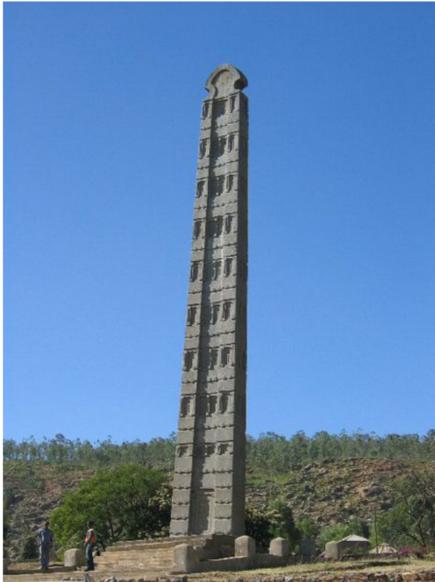
Figure 4: One of the standing stele of Axum.