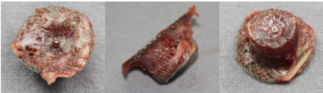
Figure 3: Different angles to show the removed occluder.