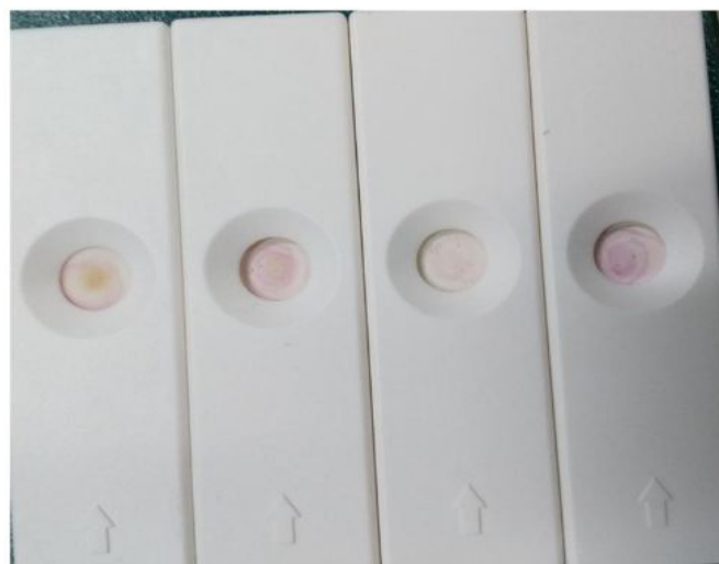
Figure 1: The composition of the test board with the test results.

The positive and negative sera were detected by the established immunogold gold infiltration method according to the method described in 3.6 The results are shown in (Figure 3).