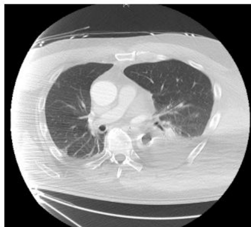
Figure 3: Left intrathoracic hematoma with extension to extra thoracic soft tissue.