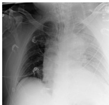
Figure 4: Left side hematoma on chest x-ray.