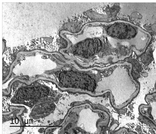
Figure 2: Extensive foot process effacement.

The medications she was taking at home included Alendronate, Bupropion, Sitagliptin, Lovastatin, Metformin, MiraLAX, Losartan, Calcium and Vitamin D. She denied use of over the counter Non-steroidal anti-inflammatory drugs, herbal medications. In the absence of other causes for nephrotic syndrome and recent use of Alendronate (started about 4 months ago), we strongly suspect the possible relationship of minimal change disease to oral Alendronate, given bisphosphonates are associated with nephrotic syndrome.