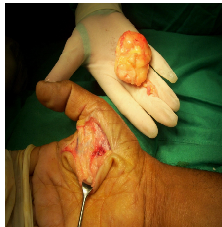
Figure 4: The exeresis of the lipoma is completed.

Histopathological study. Biopsy was performed by aspiration with a fine needle, prior to the operation and after the operation the piece was sent to the anatomopathological department and the definitive diagnosis of the surgical piece is: adult fat cells, not atypical cell. Evolution:Satisfactory: functional as a cosmetic 4 months after surgery.