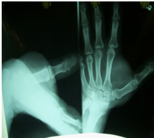
Figure 1: Radiological study of the right hand. Surgical treatment.

This is a patient of a 36-year-old patient with a previous health history who has noticed a volume increase in the right hand for about a year, which causes slight difficulty in performing the digital clamp and the main concern is cosmetic Physical examination: A tumor is observed and palpated in the thenar region of the right hand with x tension to the first interdigital space by its dorsal and palmar face [2]. Complementary exams Hematology: Hb. 12.4 g / l, glycemia .5.1, coagulogram.normal, creatinine . \mu mol / L, erythro sedimentation. 5 mm h (Figures 1-4) IMAGING EXAMS.