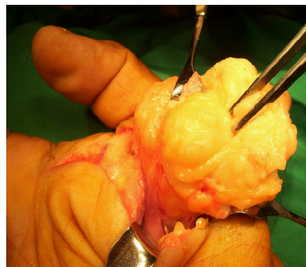
Figure 3: Lipomatous dissected tumor.