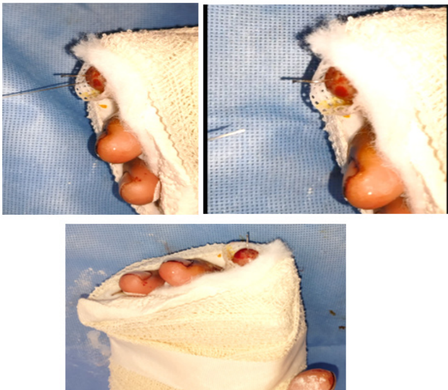
Figure 3: pricking test.