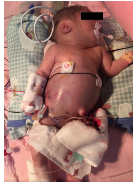
Figure 1: The newborn appeared to be generally edematous, particularly in the abdomen.

A gestational age 29-week and body weight 1,425-gram baby was born by a 33-year-old mother at her 2nd gestation with acute onset of vaginal hemorrhage. Tocolysis was given but symptoms persisted before preterm labor, and edematous placenta was noticed when delivery. After delivery, baby was no spontaneous crying and no spontaneous respiration. Apgar scores were 1, 1 and 1 at 1, 5 and 10 minutes, respectively. The initial vital signs of the baby under ventilator support were as follow: body temperature 34.7 degree Celsius, heart rate 102 beats per minute respiratory rate 15 cycles per minute and blood pressure 39/29 millimeters of mercury. Generalized cyanosis and edema were noticed found on physical examination (Figure 1). Massive ascites without hepatosplenomegaly was observed with bilateral pleural effusions but no obvious cardiac abnormalities or pericardial effusion by ultrasonography. Ascites and left pleural effusion were tapping. Resuscitation with fluid hydration and inotropic medications as well as intubation was performed due to unstable hemodynamics. However, profound desaturation with metabolic acidosis aggravated and the baby eventually expired approximately 6 hours after birth.