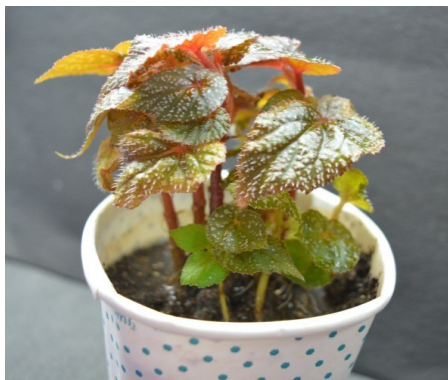
Figure 3: Hardening of tissue culture raised plants.

Seed germinated and regenerated plantlets that are well developed were transplanted on sand medium and showed remarkable acclimatization to the environment (95% survivability) (Figure 3). The acclimatized plantlets were successfully transferred in the field with 93% survivability. The field transferred plants showed absence of variability with respect to the in vivo generated plants.