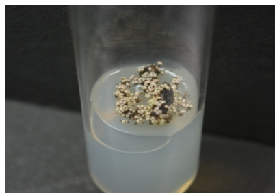
Figure 1: Directly pretreated seeds with 0.1% mercuric chloride showing nitrification and seed dormancy.

the medium, explants, hormonal combinations and culture maintenance conditions. HgCl_2 sterilant yielded the optimal results with seeds when compared to other sterilants. Direct pre-treatment of capsule with 0.1% HgCl_2 for 5 min was effective when compared to direct treatment of seeds (i.e., it leads to dormancy, retarded growth with chlorosis with the germinated seedlings) (Figure 1).